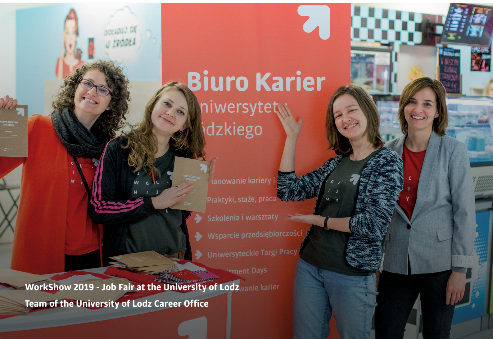
WorkShow 2019 - Job Fair at the University of Lodz

The UL has recently implemented a “VIP alumni programme”, which is addressed to the group of the most outstanding graduates of the university. It includes mentoring projects for the most talented students, regular lectures and classes with VIP graduates, as well as reunions. The university also monitors its graduates’ careers – according to our research about 87% of MA graduates find a job within one year after graduation!