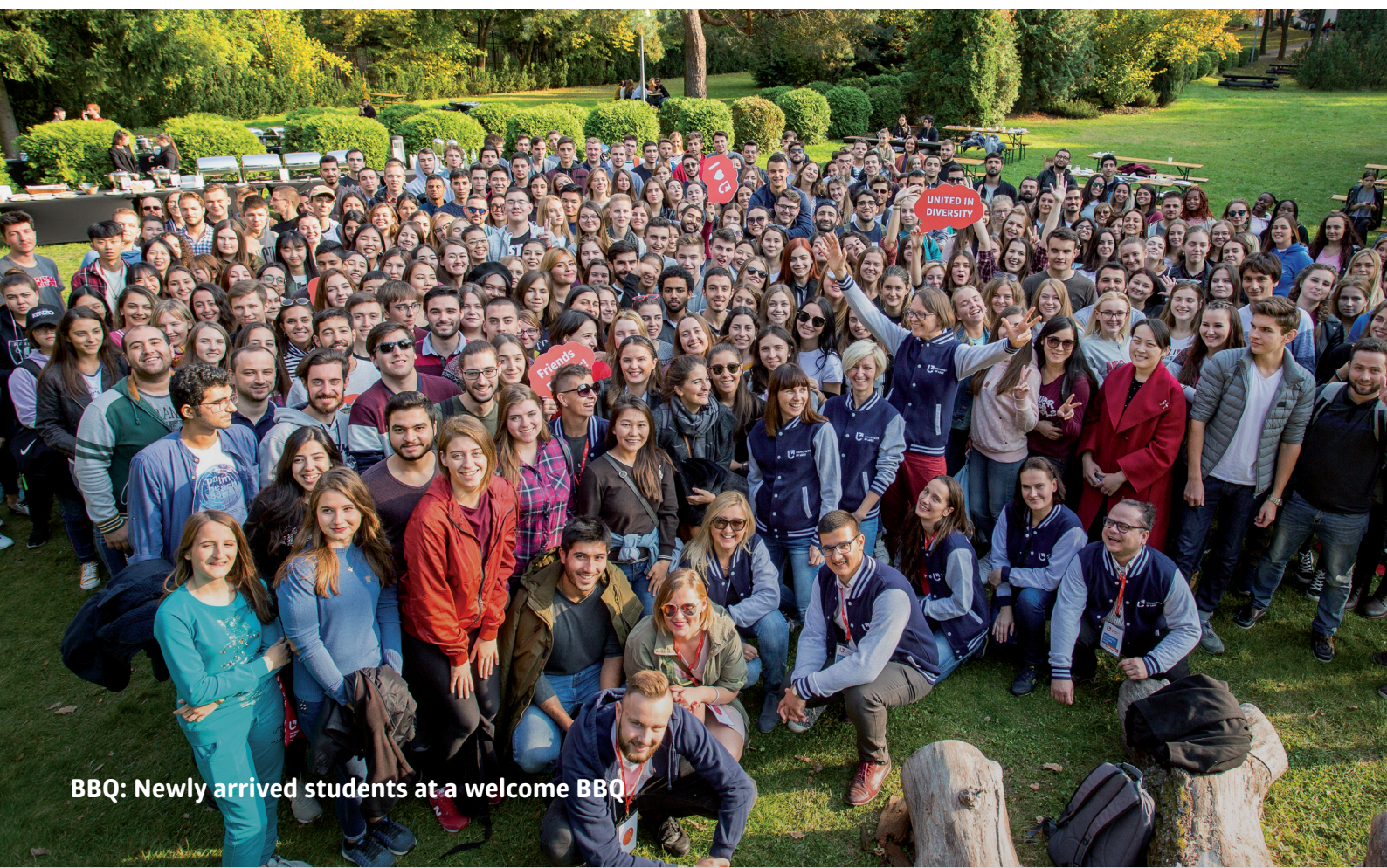
BBQ: Newly arrived students at a welcome BBQ

Supporting culture: The University of Lodz is a hub of cultural life, open to art and activities outside academic life. It provides patronage for numerous concerts, and participates in festivals and the cultural life of the city and its region.