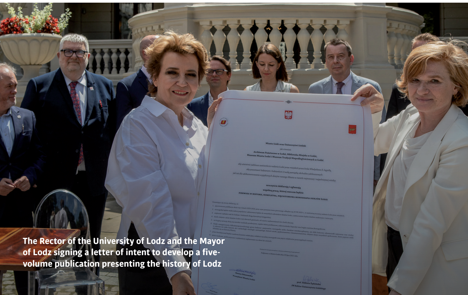
The Rector of the University of Lodz and the Mayor of Lodz signing a letter of intent to develop a five-volume publication presenting the history of Lodz

We carry out a number of various projects addressed to different groups of stakeholders, including students, university employees, local society and business. This approach is also expressed by formal agreements with the City of Lodz and international business entities operating in the city and its region. Moreover, we actively work with the third sector to better understand the needs of our post-industrial city and provide support for the transformation towards a modern, vibrant and fair community with opportunities for growth. The University of Lodz is one of the first universities in Poland that have signed the Declaration of Social Responsibility. The document indicates the main directions of development and activities for social responsibility that can be implemented by the academic community. It fosters the idea of equality, diversity, tolerance and respect for human rights in all areas of academic life.