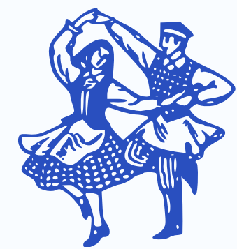
dance and games